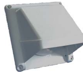
UFH Model UltraFlo Hood