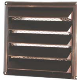
AI Model Air Intake

All louvers and hoods are securely fastened to prevent blow-off unlike the competing models. The collar is large enough to allow easy and secure attachment of pipe.