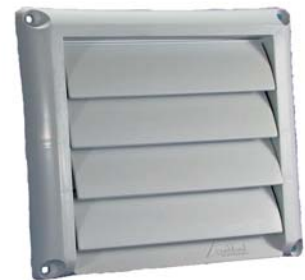
LH Model Movable Louvers