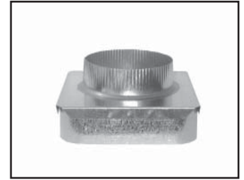
Adjustable Tile Adapter