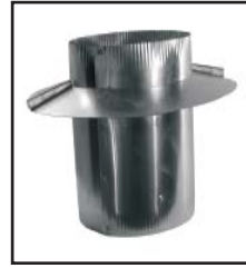
Wind Cap Adapter