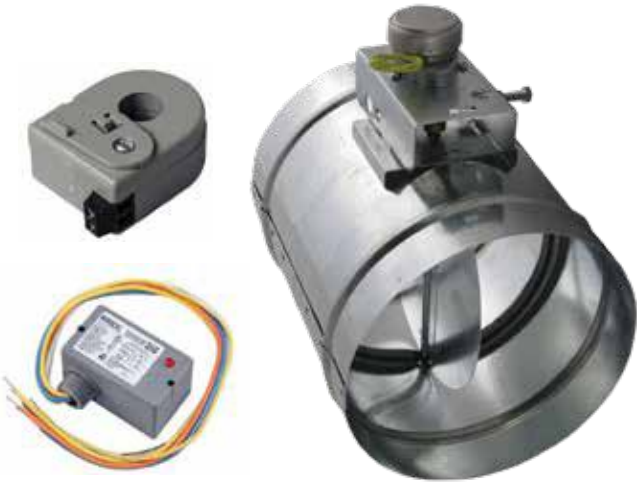
Universal Relay with Current Switch