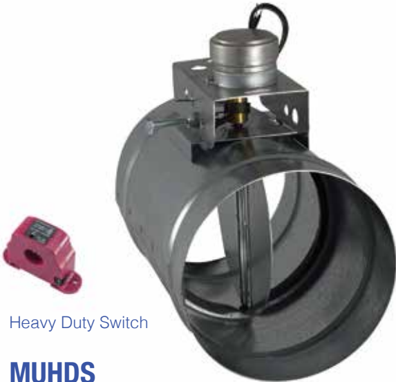
Heavy Duty Switch